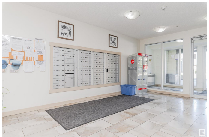
223-5816 Mullen Pl NW, Edmonton, AB