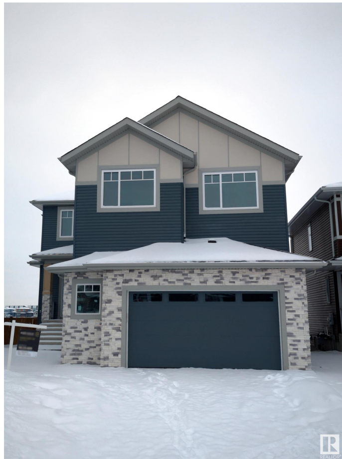
91 Edgefield Wy, St. Albert, AB

2 Storey 2,848 +/- SF on a Walk-Out lot onto the Pond. Fully fenced and Landscaped Plus 1,193 +/- SF Bsmt developed. TOTAL 4,041 +/- SF developed. Designed for family enjoyment plus large gatherings! Enjoy tranquility watching the Sunset over the pond. Covered deck off Dining Room, Primary Suite and at ground level patio. Huge Spa style Ensuite - separate water closet. Double vanity. Invigorate in the spa shower or relax in the huge soaker tub. 3 additional Bedrooms on the same floor all with 4 Pce Bathrooms. Plus, main floor den/bedroom with adjacent full bath. 5th Large Bsmt. Bdrm. Large Kitchen Plus a full 2nd Kitchen. Entertain guests in the Living Room while others relax in the Bonus Room overlooking the Great Room or bsmt family room c/w wet bar w bar stool height island or enjoy the games room. Open design allows flow of natural light thru-out. Store your toys™ in the oversized garage. Access to the Park/Pond/Pathways. Major Shopping, Schools, Recreation Facilities, Major/Minor Arterial Roads