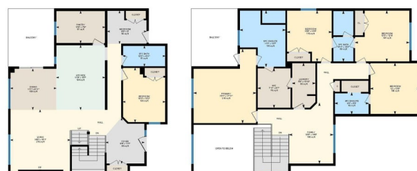
Main Floor Exterior Area 1281.25 sq ft

Main Building - Total Exterior Area Above Grade 2348.01 sq ft